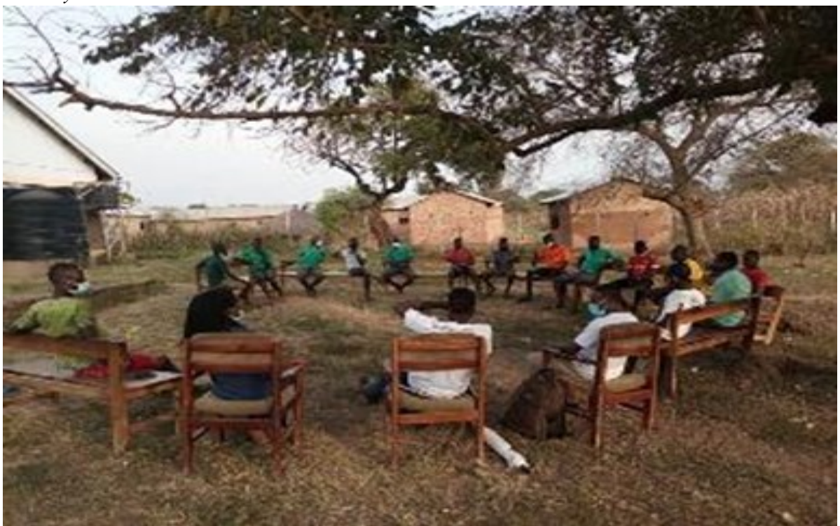
Figure 2: Male only youth dialogue at Lela-obaro village, Bobi sub-county in Omoro District, Acholi cluster in February 2021